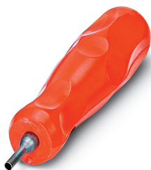
Positioning and unlocking tool for RC crimp contacts for pin/socket with metal clip, diameter 1.0 ... 1.5 mm

Please be informed that the data shown in this PDF Document is generated from our Online Catalog. Please find the complete data in the user's documentation. Our General Terms of Use for Downloads are valid ( http://phoenixcontact.com/download )