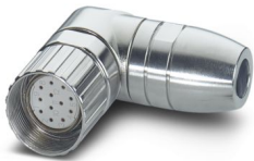
The figure shows the 12-pos. product version

Please be informed that the data shown in this PDF document is generated from our online catalog. Please find the complete data in the user documentation. Our general terms of use for downloads are valid.