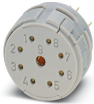
The figure shows the 9-pos. product version

Please be informed that the data shown in this PDF document is generated from our online catalog. Please find the complete data in the user documentation. Our general terms of use for downloads are valid.