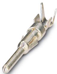
Crimp contact, rolled, Single contact, contact diameter: 1 mm, crimp range: 0.22 mm 2 ... 0.56 mm 2 , Single contact

Please be informed that the data shown in this PDF Document is generated from our Online Catalog. Please find the complete data in the user's documentation. Our General Terms of Use for Downloads are valid ( http://phoenixcontact.com/download )