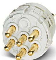
The figure shows the 6-pos. product version

Please be informed that the data shown in this PDF document is generated from our online catalog. Please find the complete data in the user documentation. Our general terms of use for downloads are valid.