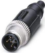
Terminating resistor CANopen®/DeviceNet™ M12

Please be informed that the data shown in this PDF document is generated from our online catalog. Please find the complete data in the user documentation. Our general terms of use for downloads are valid.