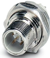
Device connector rear mounting, 4-position, Pin, straight, M12, A-coding, Solder pins, cable gland Pg9

Please be informed that the data shown in this PDF document is generated from our online catalog. Please find the complete data in the user documentation. Our general terms of use for downloads are valid.