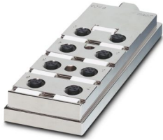
The figure shows a version with 8 slots

Please be informed that the data shown in this PDF document is generated from our online catalog. Please find the complete data in the user documentation. Our general terms of use for downloads are valid.