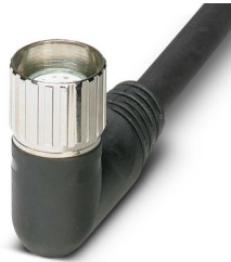
Socket M23, 19-pos., angled, shielded, with shielded, connected master cable, length: 25 m

Please be informed that the data shown in this PDF document is generated from our online catalog. Please find the complete data in the user documentation. Our general terms of use for downloads are valid.