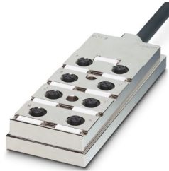
Sensor/actuator box, without LED, with master cable, markers and double-occupied slots

Please be informed that the data shown in this PDF document is generated from our online catalog. Please find the complete data in the user documentation. Our general terms of use for downloads are valid.