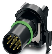
The figure shows the shielded version

Please be informed that the data shown in this PDF document is generated from our online catalog. Please find the complete data in the user documentation. Our general terms of use for downloads are valid.