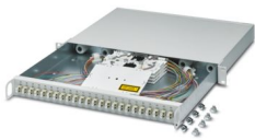
19" splice box, gray, 24 x LC duplex OM2

Splice box, design: 19" rack patch module, degree of protection: IP20, material: Sheet steel, connection method: Splicing, color: light gray RAL 7035, Ethernet