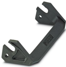
Single locking latch for B24 housing, HC-EVO....AL and HC-STA....AL

Please be informed that the data shown in this PDF document is generated from our online catalog. Please find the complete data in the user documentation. Our general terms of use for downloads are valid.