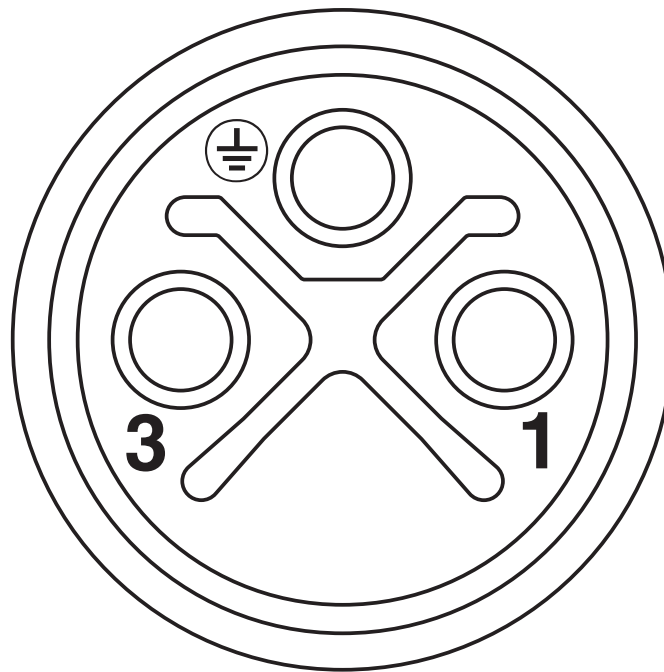
Pin assignment of M12 socket, 3-pos., S-coded, socket side view