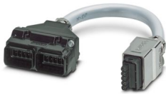
Y distributor with MSTB plug

Y distributor, degree of protection: IP65, number of positions: 5, material: Metal, connection method: Coupling, color: black