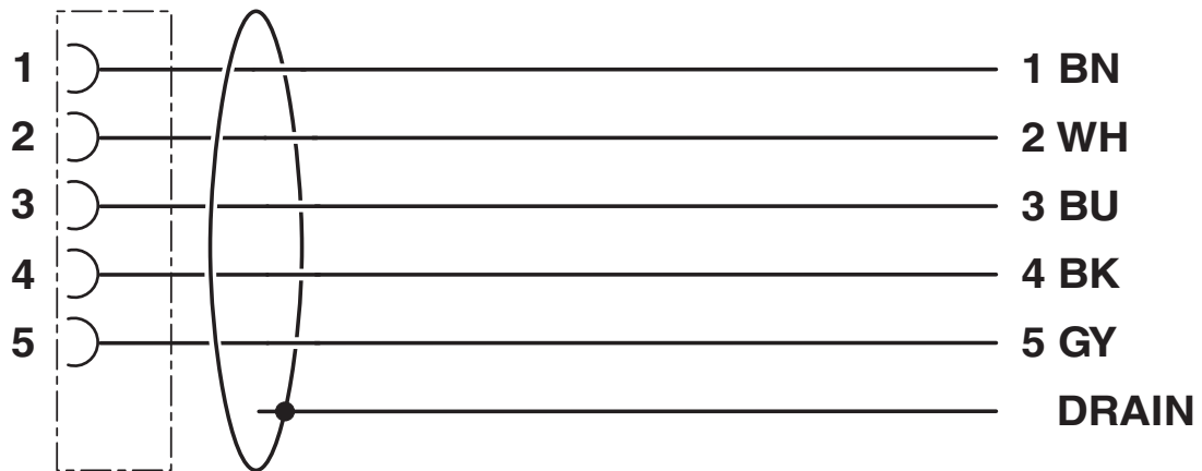
Contact assignment of the M12 plug and the M12 socket