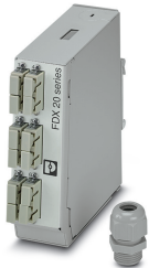
DIN rail splice box, without pigtails, for 6x SC duplex

Please be informed that the data shown in this PDF Document is generated from our Online Catalog. Please find the complete data in the user's documentation. Our General Terms of Use for Downloads are valid ( http://phoenixcontact.com/download )