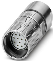
The figure shows the 12-position version

Please be informed that the data shown in this PDF document is generated from our online catalog. Please find the complete data in the user documentation. Our general terms of use for downloads are valid.