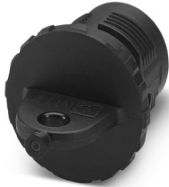
Plastic protective cap, M17, series: M17 PRO

Please be informed that the data shown in this PDF document is generated from our online catalog. Please find the complete data in the user documentation. Our general terms of use for downloads are valid.