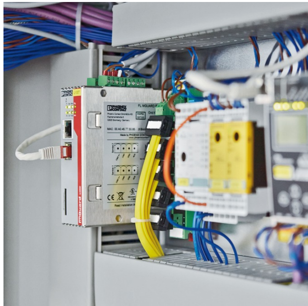
The security router ensures secure VPN connections

The user initiates the establishment of the IPsec tunnel to the Pfiffner Remote Services Center by actuating a key switch. The service technician then has access to the system. The system operator thus maintains control over any access to the application. FL MGUARD's optional external configuration memory is also helpful in this regard. Since Pfiffner employees often do not know the IP parameters of the customer network before machine delivery, the respective configuration can simply be transmitted via SD card later.