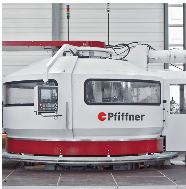
Rotary transfer machine from Pfiffner for mass production of precision parts

The processing centers, which are used for mass production of precision parts for the automotive industry, for example, are manufactured by 450 people around the world.