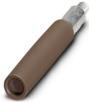
Test plug strip, number of positions: 1, color: brown

Please be informed that the data shown in this PDF document is generated from our online catalog. Please find the complete data in the user documentation. Our general terms of use for downloads are valid.