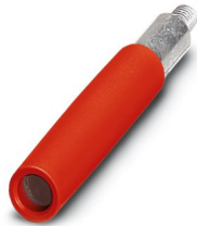
Test plug strip, number of positions: 1, color: red

Please be informed that the data shown in this PDF document is generated from our online catalog. Please find the complete data in the user documentation. Our general terms of use for downloads are valid.