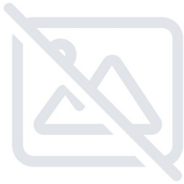
Test disconnect terminal block

Please be informed that the data shown in this PDF document is generated from our online catalog. Please find the complete data in the user documentation. Our general terms of use for downloads are valid.