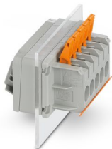
The figure shows a 5-position version

Panel feed-through terminal block, connection method: Push-lock connection, Push-in spring connection, number of positions: 3, load current: 41 A, cross section: 2.5 mm 2 - 16 mm 2 , connection direction of the conductor to plug-in direction: 0 °, width: 54.4 mm, color: gray