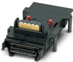
Axioline P bus base module for housing type F2

https://www.phoenixcontact.com/us/products/1052428