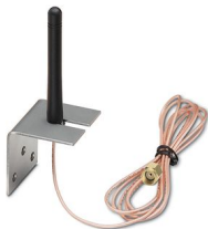
Omnidirectional antenna for wall mounting, frequency band: 2.4 GHz, gain: 2 dBi, degree of protection: IP65, connection: RSMA (male), incl. 1.5 m connecting cable, mounting bracket, and mounting material

https://www.phoenixcontact.com/us/products/2701362