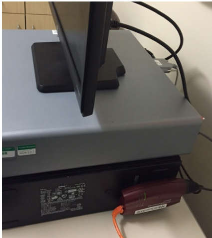
Phoenix Contact's mGuard SMART2 devices provided IT-approved security, with easy-to-use features such as USB power, remote configuration, simple cable management, and faster installation time.

Finally, some devices were connected to the network without any protection at all. This opened the gate to a potential security breach.