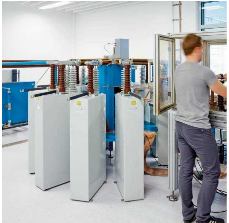
Lightning surge current generator

In order to generate the pulses, energy is provided at 141 kJ, which is taken from a capacitor bank with 44 \mu\text{F} and a maximum charging voltage of 80 kV. A measuring data acquisition system with modular design and a high scanning rate supplies the extremely precise measuring data.