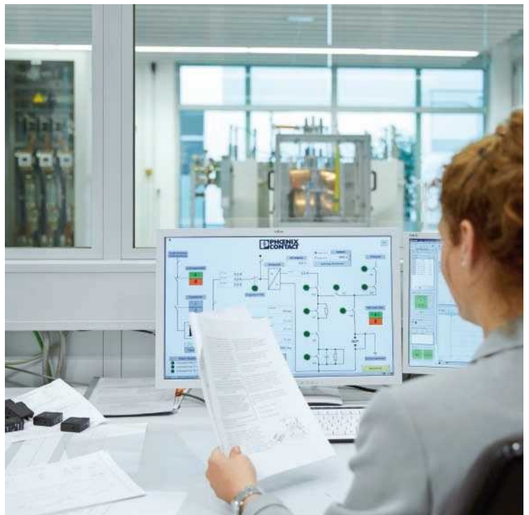
Direct current testing system

The current can be adjusted in 1-Volt increments up to 1,800 V DC.