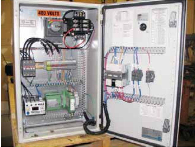
Pump control panel for Wheatland, Wyo. water well control

oil pipeline, electric utility and water/wastewater industries, where the remote location and the distances involved made cabling virtually impossible. Field instrumentation signals are hard-wired into a localized PLC or I/O system, and then sent to a central monitoring location or dispatcher via a telemetry link. The advent of wireless devices to eliminate the hard-wire to the field transmitters has made it possible to reduce costs even