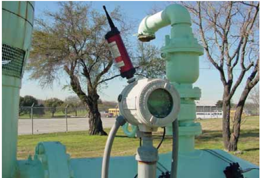
NEMA 4 transmitters for San Antonio Water Systems

a single fixed frequency. The agency issues these licenses to mitigate interference. Licensed radios are considered high power, typically up to 5 watts. This power translates to a long transmission range, often up to 40 miles.