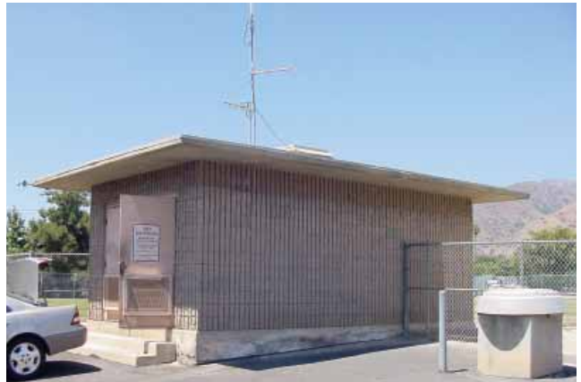
Pump station with outdoor mounted antenna installation (LaVerne, Calif.)

For example, a large Midwest sewer district faced a challenging data communications problem during the early 1990s. The district had pumping equipment and wastewater units at approximately 165 unattended locations. It used on-site data collection and a telephone link to a single computer to monitor and control all of these sites. Officials needed better information