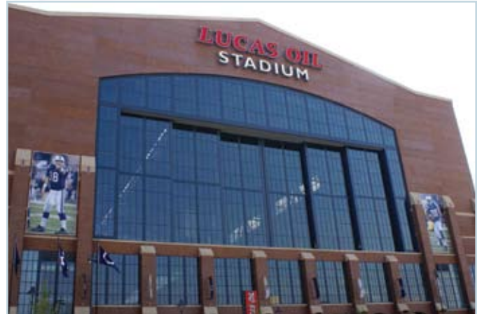
Outside view of the kinetic wall at Lucas Oil Stadium

To fix the issue with the wall panels, a DIN rail-mountable radio unit and a single 10dBi omni-directional antenna were installed on each panel for a total of eight industrial Ethernet radios controlling the six paneled walls. Two fixed radios communicate with the individual moving radios on each panel.