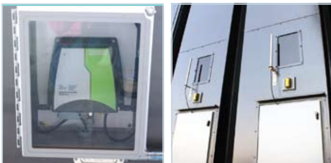
Ethernet radios with antennas monitor video from the stadium's kinetic wall

Uni-Systems began its business creating moveable architecture solutions for the aerospace industry over 40 years ago and recently expanded into the sports entertainment industry. The company provided total solutions on retractable roofs for several stadium projects in North America. Five major stadium projects included Uni-Systems' expertise for their designs, including The University of Phoenix, Minute Maid Park, Reliant Stadium, Lucas Oil Stadium and the new Dallas Cowboys stadium.