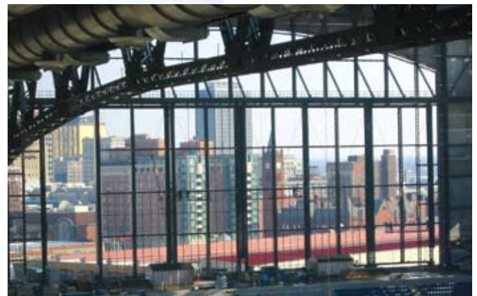
A view of the kinetic wall inside the stadium during construction